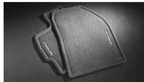
Carpet Floor Mats & Cargo Mat $200 Installed MSRP*