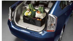
Cargo tote by Nifty Products $40 Installed MSRP*