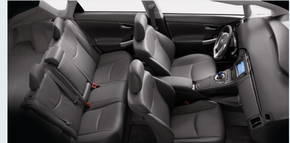
Prius interior shown in Dark Gray leather with available Advance Technology Package [28]