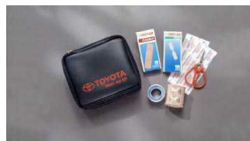
First aid kit $29 Installed MSRP*