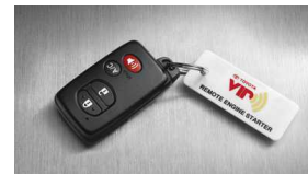
Remote engine start $529 Installed MSRP*