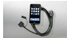
iPod Interface $299 Installed MSRP*