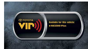
VIP RS3200Plus Security System $359 Installed MSRP*