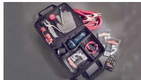
Emergency assistance kit $70 Installed MSRP*