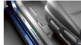
Illuminated door sill $359 Installed MSRP*